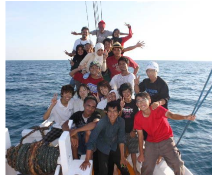
(Ocean field practice in Indonesia)

Student evaluation will be based on communication skills with people in the community, group work in their research field, student journals, and final presentations in English.